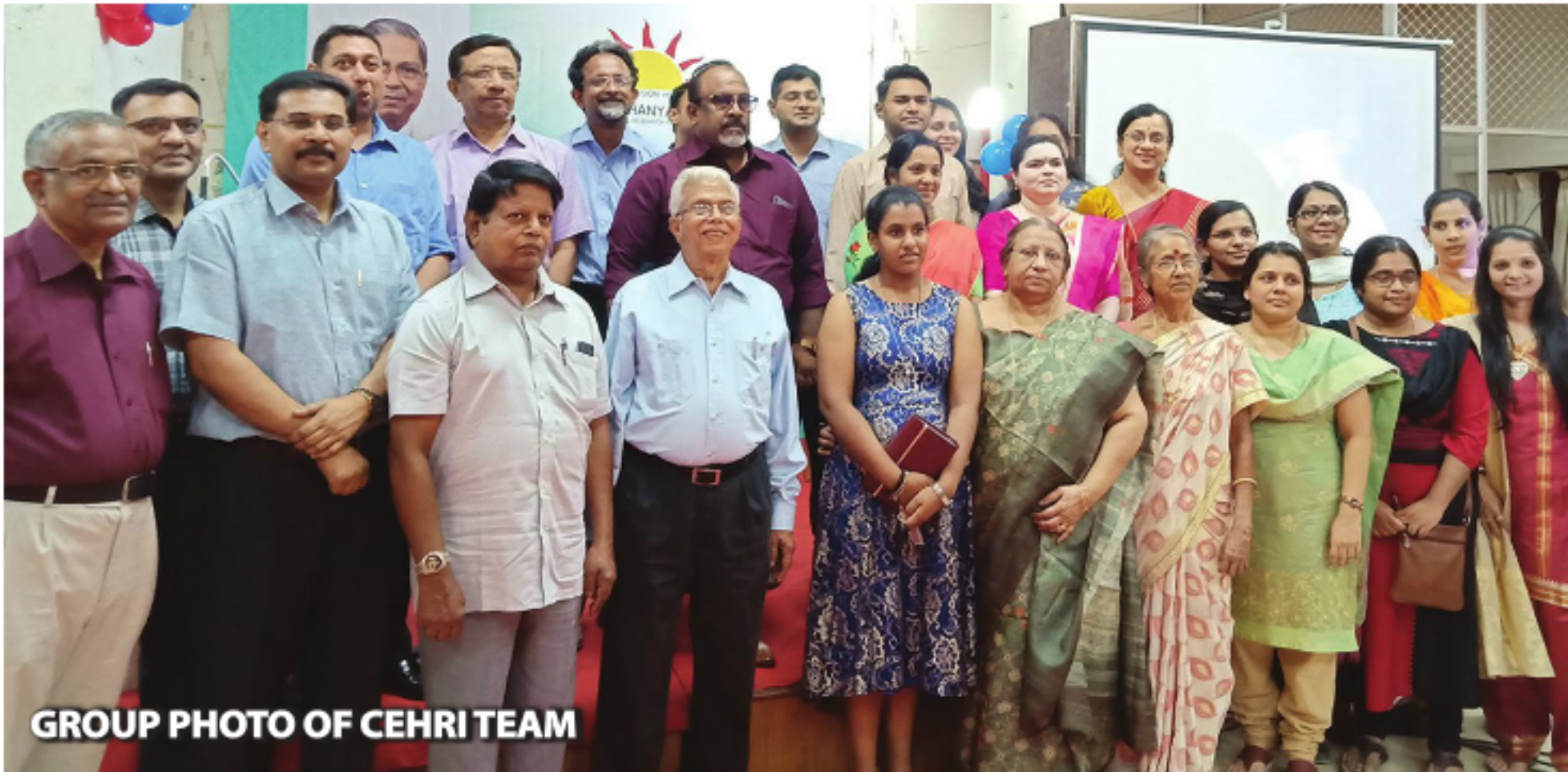
GROUP PHOTO OF CEHRI TEAM