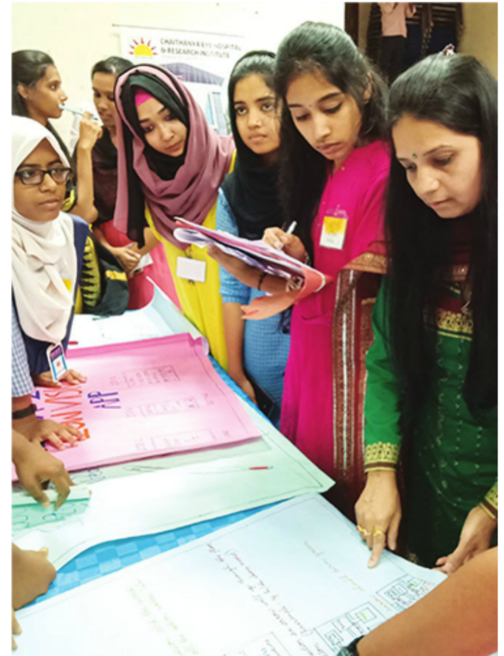
STUDENTS HIGHLIGHTING THE IMPORTANCE OF LVD