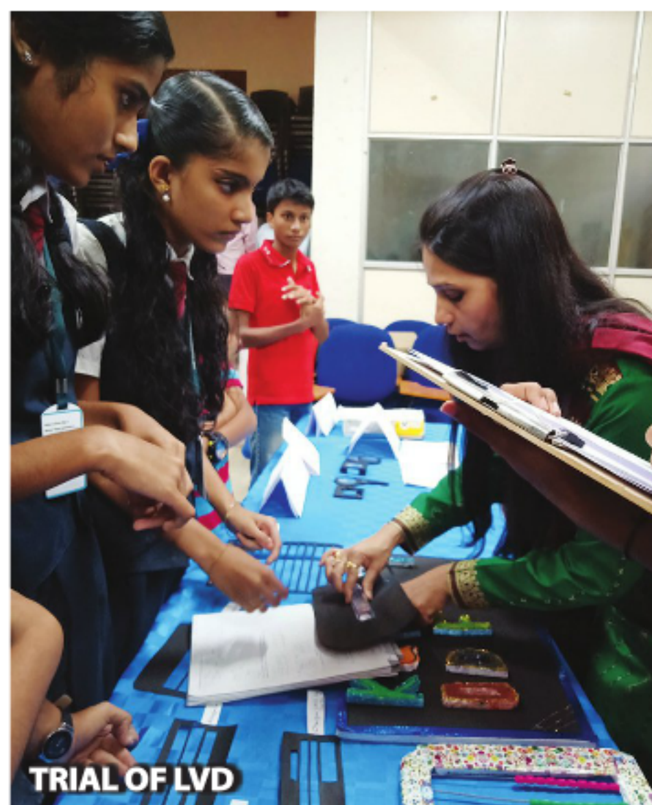
TRIAL OF LVD